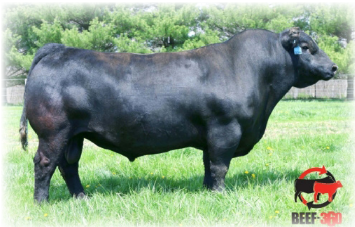
MAR Captain 8027 AAA#19881823